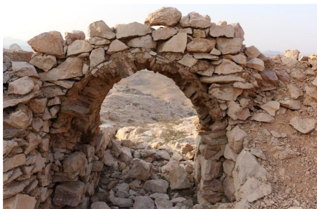
Figure 1. Houra Bargha, Sohar