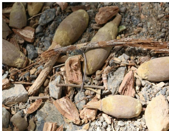
Figure 2. Almashwa Tree, Liwa