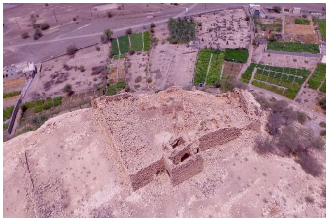
Figure 3. Mashaiq Bani Kharous, Alsuwaiq