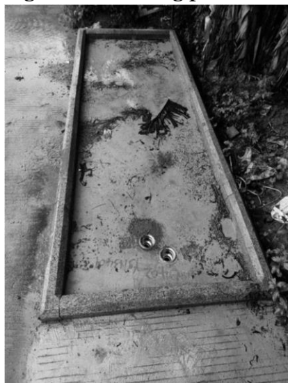
Figure 2: Renderings of the garbage collection point renovation

Two stainless steel sealable and openable floor drains are set on the hardened ground of the garbage collection point, one for collecting rainwater and the other for collecting rainwater. On sunny days, the floor drain for collecting sewage is opened, and the floor drain for collecting rainwater is closed. At this -60-