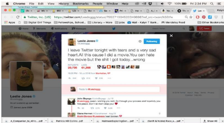
Figure 3 Archived Tweet of Leslie Jones, 2016

The hashtag #LoveForLeslieJ was created on Twitter where people posted positive remarks using the hashtag in order to pad Jones' mentions with positive words in order to help redirect the hateful comments she was receiving. Paul Feig, director of Ghostbusters , was the first to start the trending hashtag in support of protecting Leslie Jones as seen below in Figure 4 (Archived Tweet of Paul Feig, 2016).