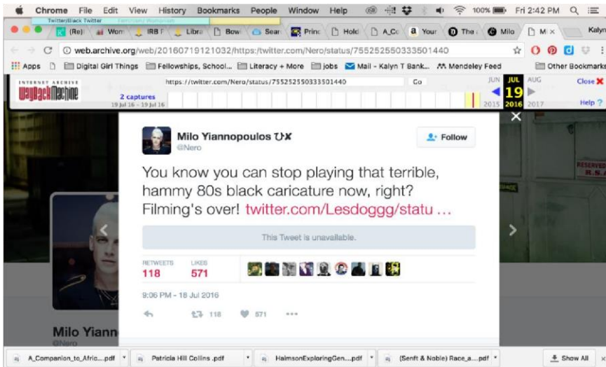
Figure 1 Archived Tweet of Milo Yiannopoulos, 2016

Actor and comedian Leslie Jones experienced trolling, on July 19 th , 2016, after the release of the remake of the fan-fiction movie Ghostbusters this summer. Leslie Jones attacker, Milo Yiannopoulos, began his trolling against Leslie Jones by stating his disdain for the remake of Ghostbusters and her role in the movie as seen below in Figure 1 and Figure 2. (Archived Tweet of Milo Yiannopoulos, 2016) After his remarks were made online other racist trolls began to fill Jones’ mentions on Twitter with lewd, cruel, and racist remarks.