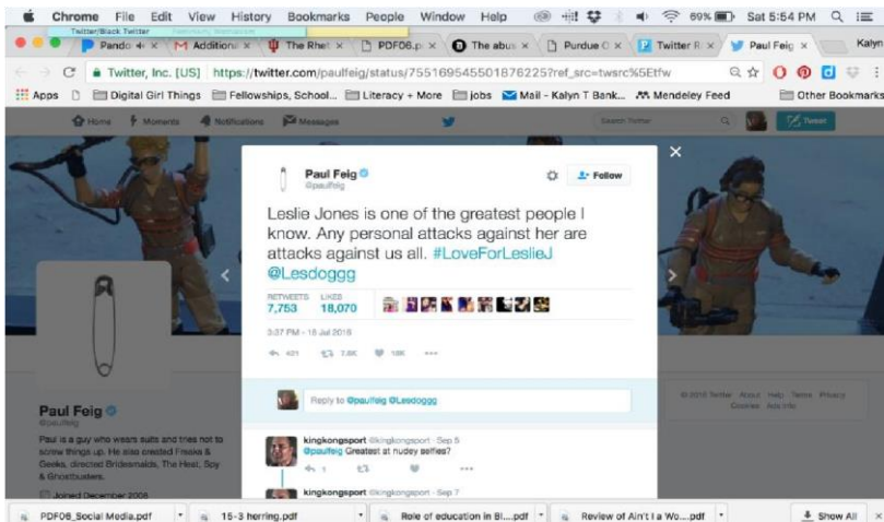
Figure 4 Archived Tweet of Paul Feig, 2016

The hashtag #LoveForLeslieJ was created on Twitter where people posted positive remarks using the hashtag in order to pad Jones' mentions with positive words in order to help redirect the hateful comments she was receiving. Paul Feig, director of Ghostbusters , was the first to start the trending hashtag in support of protecting Leslie Jones as seen below in Figure 4 (Archived Tweet of Paul Feig, 2016).