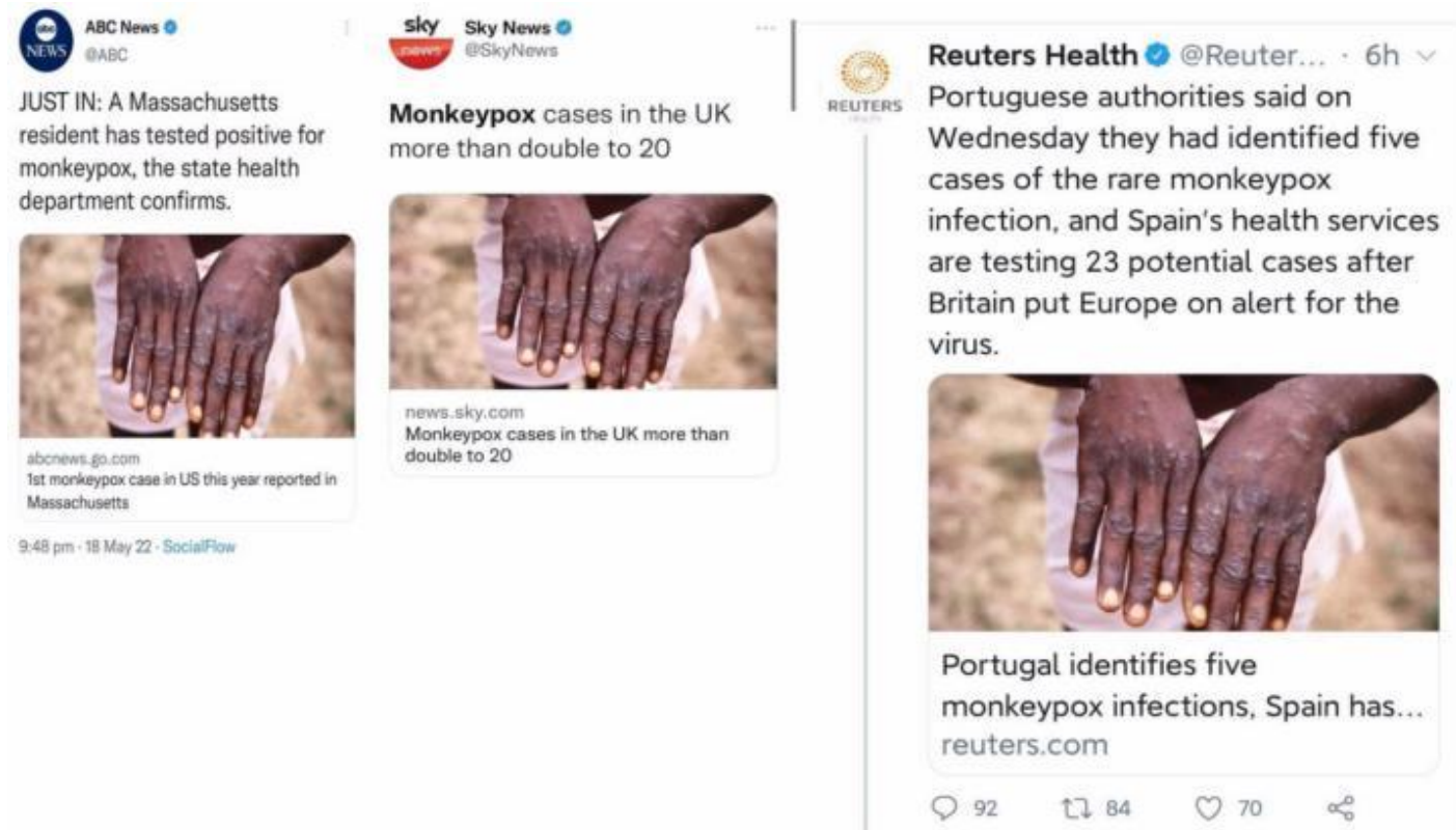
Figure 1. Screenshots of tweets from the verified Twitter accounts of ABC News, Sky News, and Reuters illustrate how foreign media use an identical image of the hands of an African with monkeypox marks to announce the outbreak of monkeypox outbreak in Western and European countries in 2022.

In Figure 1 above, on their verified Twitter account, the ABC News headline states that monkeypox was confirmed in Massachusetts, Sky News mentioned confirmed cases in the UK, and Reuters Health reported confirmed cases in Portugal. The image these foreign media used for illustration did not match the content of their text. According to the Centers for Disease Control and Prevention, images showing the arms and torso of patients with monkeypox marks were created by CDC/ Brian W.J. Mahy in 1997 during an investigation of a monkeypox outbreak in DR Congo (CDC, 1997). The use of these images created 26 years ago by these foreign news agencies to announce the 2022 monkeypox outbreak in Western and European countries portrays Africa as a geography of disease outbreaks. CNBC (The Associated Press, 2022), 7 News Miami (Browning, 2022), and BBC News (BBC News, 2022) all used the same image of a dark-skinned African torso in their online publications of the 2022 monkeypox outbreak in Western and European countries, as seen in Figure 2.