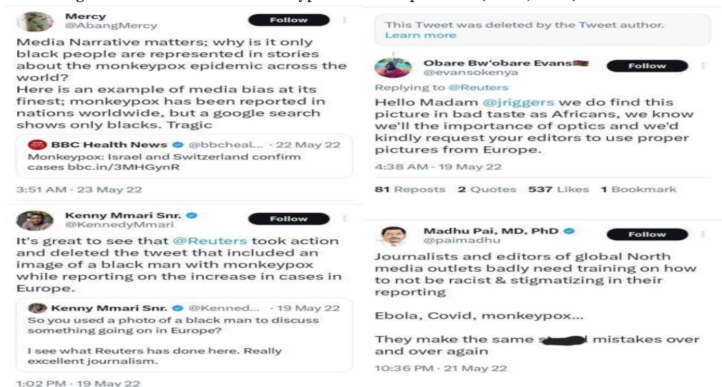
Figure 4. Screenshots of reactions on Twitter to counter the use of Black skin images by the global North media in their online reporting of the 2022 monkeypox cases in Western and European countries.