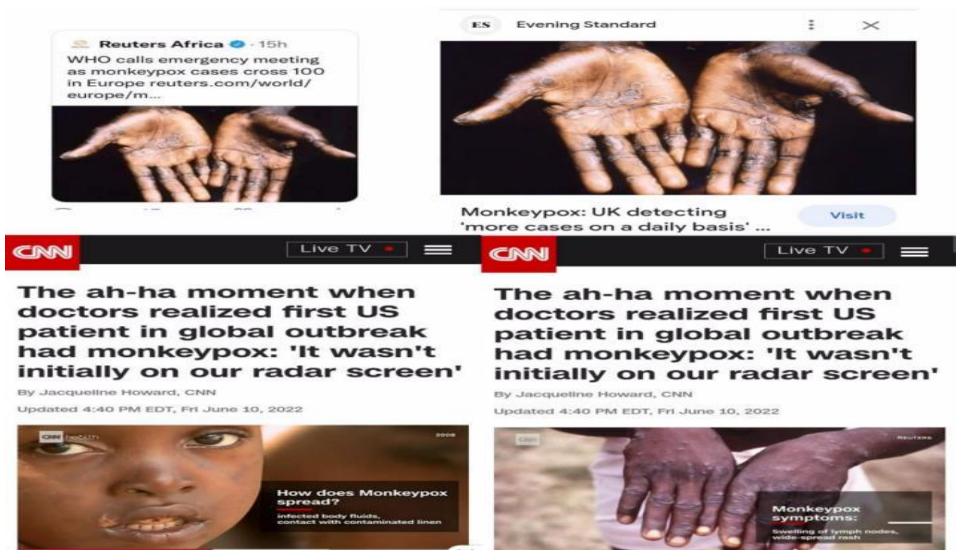
Figure 3. Screenshots of headlines gotten from the tweet and website publications of Reuters Africa, Evening Standard, and CNN on the 2022 monkeypox outbreak.

In Figure 3, Reuters Africa and Evening Standard (A UK-based media company) used identical images of the hands of an African taken in 1997 during a monkeypox investigation in DR Congo (CDC, 1997) to report outbreaks in Europe. On the other hand, CNN (Howard, 2022) used the image of an African to illustrate how monkeypox spread and the symptoms of monkeypox in a video dated 2008. The collective use of images and bodies of dark-skinned Africans to illustrate news headlines and publications about the monkeypox outbreak portrays