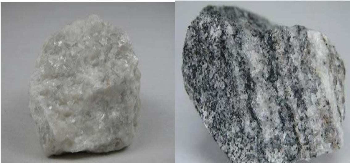
Plate x: Marble is a non-foliated metamorphic produced by metamorphism of limestone It is composed of calcium carbonate.