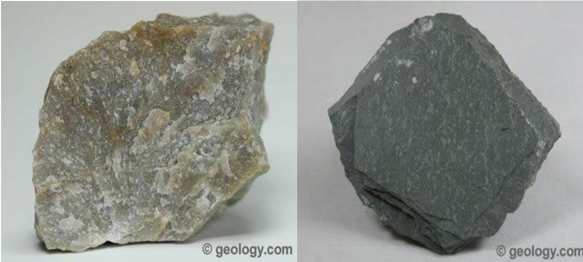
Plate viii: Quartzite is a non-foliated metamorphic rock produced by metamorphism of sandstone