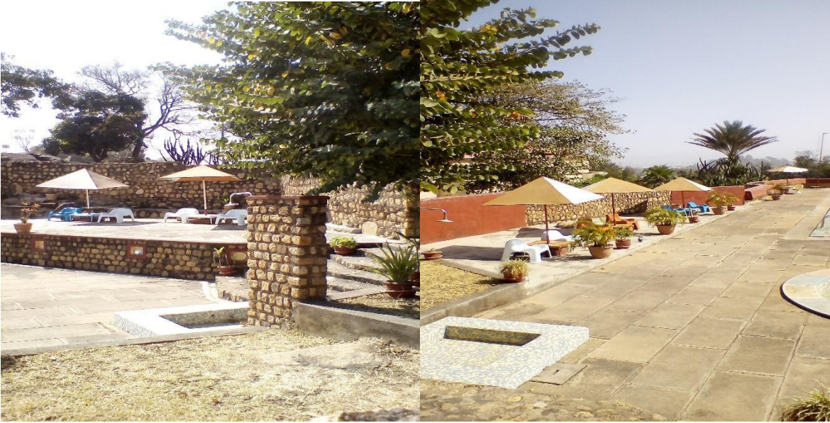
Plate xiv: Cut flagstone made from limestone used for pool decks, patios, wall caps and garden walkways at Hill Station Hotel, Jos.