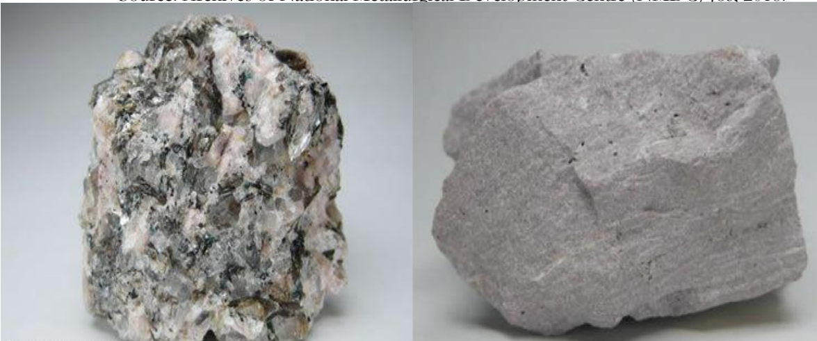
Plate iii: Pegmatite is a light-colored, extremely Coarse-grained intrusive igneous rock.