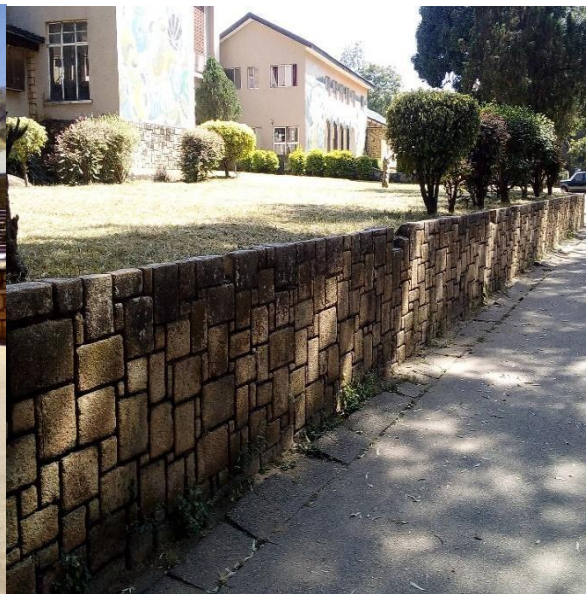
Plate xiii: Retaining walls constructed from cut stones/building at the Jos Zoological Garden