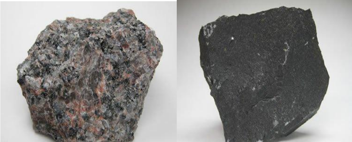
Plate i: Granite is a coarse-grained, light-colored Intrusive igneous rock