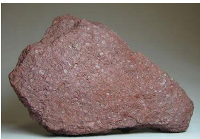
Plate vii: Iron Ore is a chemical sedimentary rock that forms when iron and oxygen (and sometimes other substances) combine in solution and deposit as a sediment.