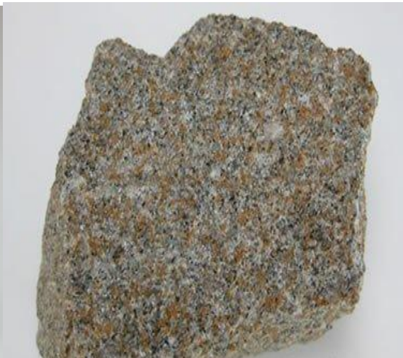
Plate vi: Sandstone a classic sedimentary rock made up of sand-size weathering debris.