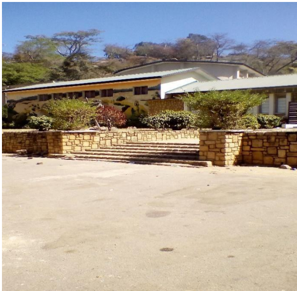
Plate xii: Irregular cut flagstone slabs steps leading to the art gallery at Jos, Zoo