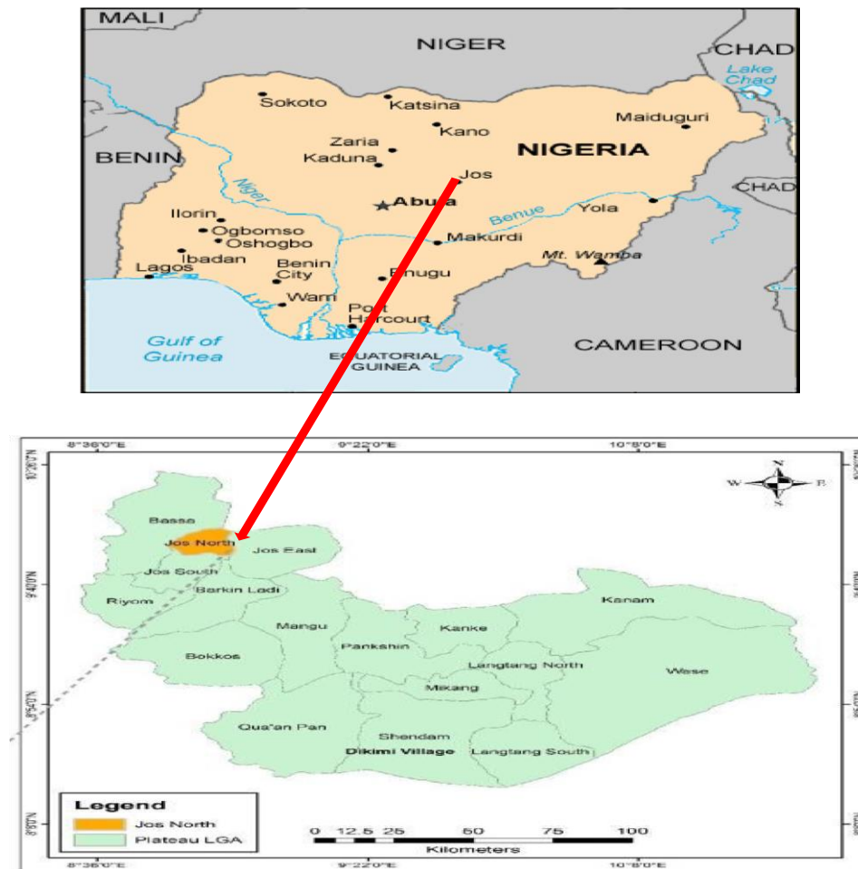
Figure 2: Map of Nigeria (top) showing Jos and Map of Plateau State (down) showing Study area.