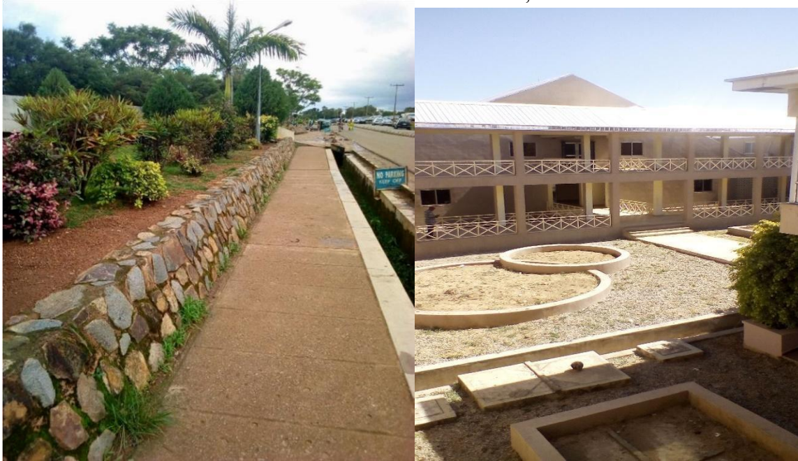
Plate xx: Sidewalk ways as hardscape element at Jos University Teaching Hospital,(JUTH) Plate xxi: Gravel used as mulch and natural ground cover at School of Post-Graduate studies, UNIJOS.