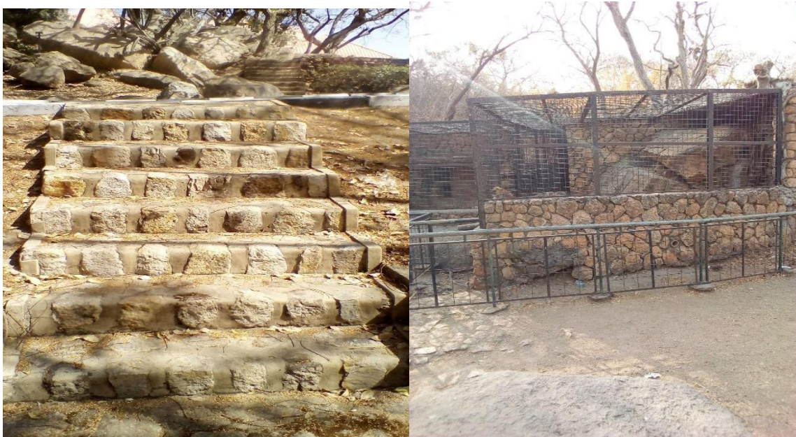
Plate xviii: Natural cut stones uses as steps at Hill Station Hotel, Jos