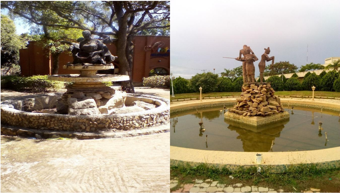
Plate xvii: Cobbles used as the base of water fountain which serves as focal points at the art gallery of Jos Zoo and the Jos University Teaching Hospital (JUTH) permanent site.