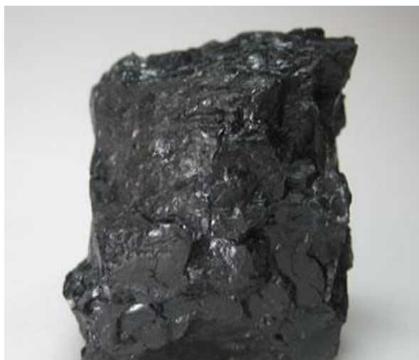
Plate v: Coal an organic sedimentary rock Formed from plant debris