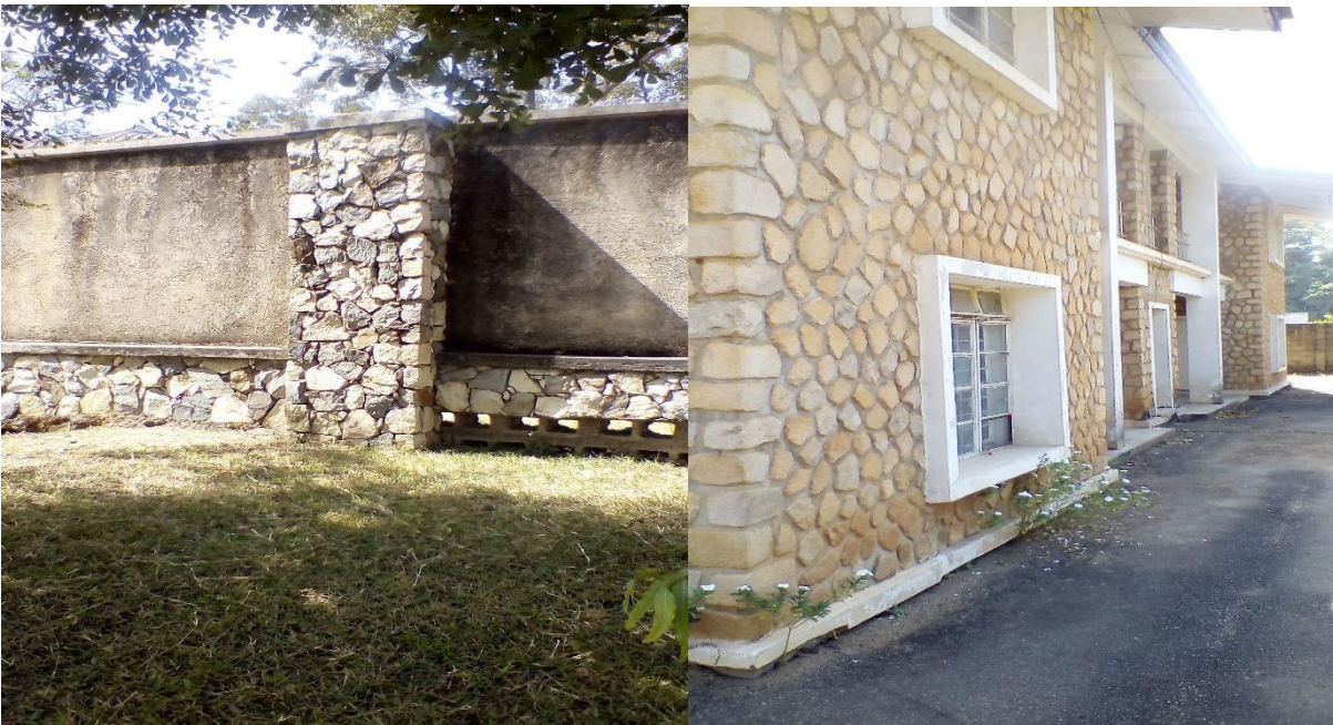
Plate xv: A mortared stone wall made from Limestone used for fencing at G.R.A. Jos.