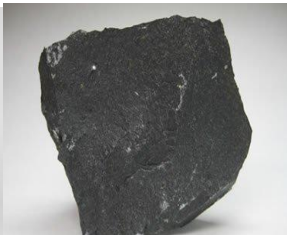
Plate ii: Basalt is a fine-grained, dark-colored Extrusive igneous rock