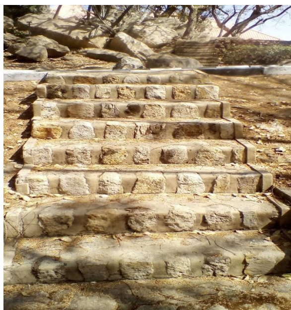
Plate xviii: Natural cut stones uses as steps at Hill Station Hotel, Jos