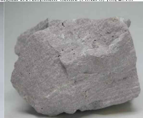
Plate iv: Rhyolite is a light-colored, fine-grained Extrusive igneous rock.