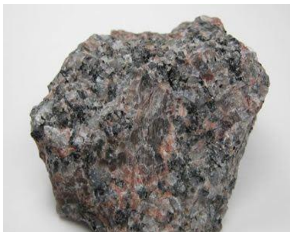
Plate i: Granite is a coarse-grained, light-colored Intrusive igneous rock

rocks. Stones such as diorite , gabbro , granite , pegmatite , and peridotite , andesite , basalt , dacite , obsidian , pumice , rhyolite , scoria , rhyolite and tuff (See Plate i, ii, iii & iv) are identified as igneous rocks (Balsubramanian, 2017).