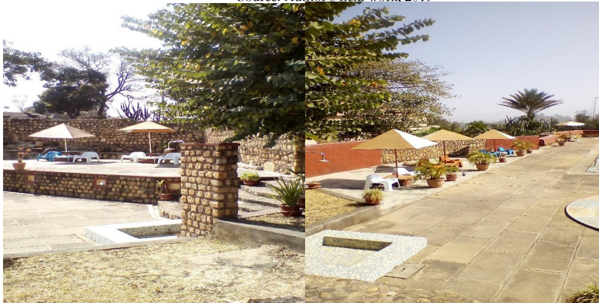
Plate xiv: Cut flagstone made from limestone used for pool decks, patios, wall caps and garden walkways at Hill Station Hotel, Jos.