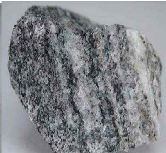
Plate xi: Gneiss is a foliated metamorphic rock that has a banded appearance and is made up of granular mineral grains. It typically contains abundant Quartz or feldspar minerals.