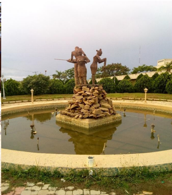
Plate xvii: Cobbles used as the base of water fountain which serves as focal points at the art gallery of Jos Zoo and the Jos University Teaching Hospital (JUTH) permanent site.