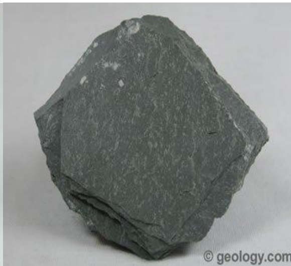
Plate ix: Slate is a foliated metamorphic rock produce through metamorphism of shale