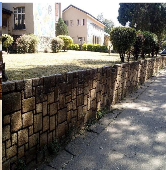
Plate xiii: Retaining walls constructed from cut stones/