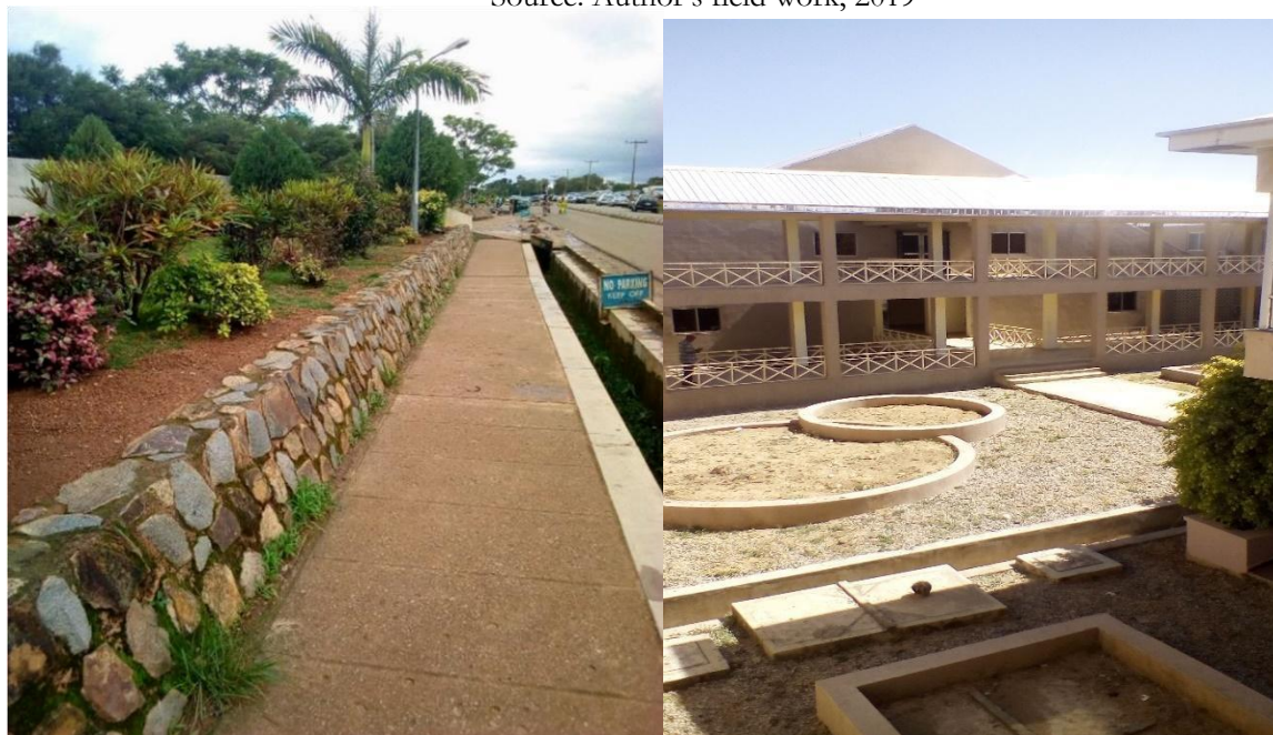
Plate xx: Sidewalk ways as hardscape element at Jos University Teaching Hospital,(JUTH) UNIJOS.