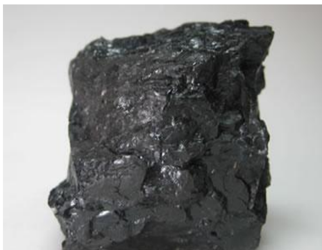
Plate v: Coal an organic sedimentary rock Formed from plant debris

weathering debris; Chemical sedimentary rocks , such as rock salt, iron ore (See Plate vii), chert, flint, some dolomites , and some limestone , form when dissolved materials precipitate from solution and Organic sedimentary rocks such as coal (See Plate v), some dolomites, and some limestone, form from the accumulation of plant or animal debris (Balsubramanian,2017).