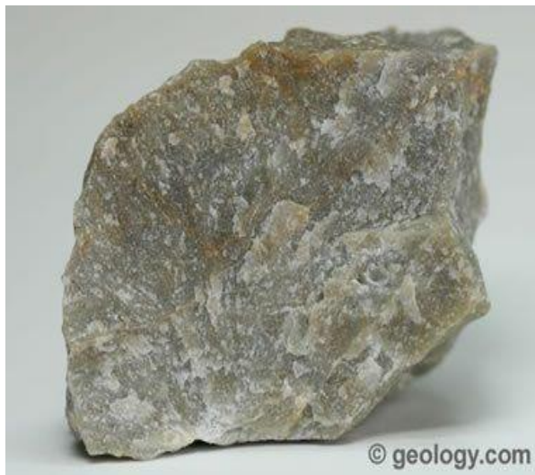
Plate viii: Quartzite is a non-foliated metamorphic rock produced by metamorphism of sandstone

are two basic types of metamorphic rocks. Foliated metamorphic rocks such as gneiss, phyllite, schist, and slate (See Plate ix & xi) have a layered or banded appearance that is produced by exposure to heat and directed pressure and Non-foliated metamorphic rocks such as hornfels, marble, quartzite, (See Plate viii & x) and novaculite do not have a layered or banded appearance (Balsubramanian, 2017).