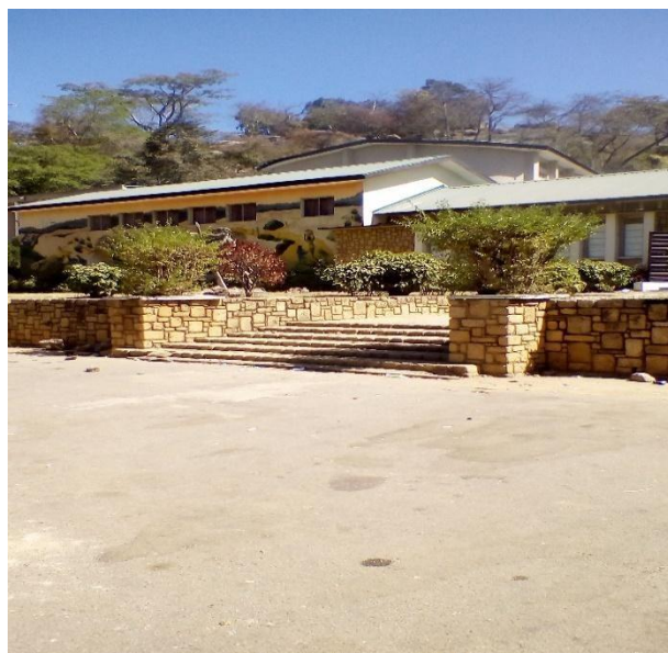
Plate xii: Irregular cut flagstone slabs steps