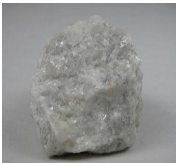
Plate x: Marble is a non-foliated metamorphic produced by metamorphism of limestone It is composed of calcium carbonate.