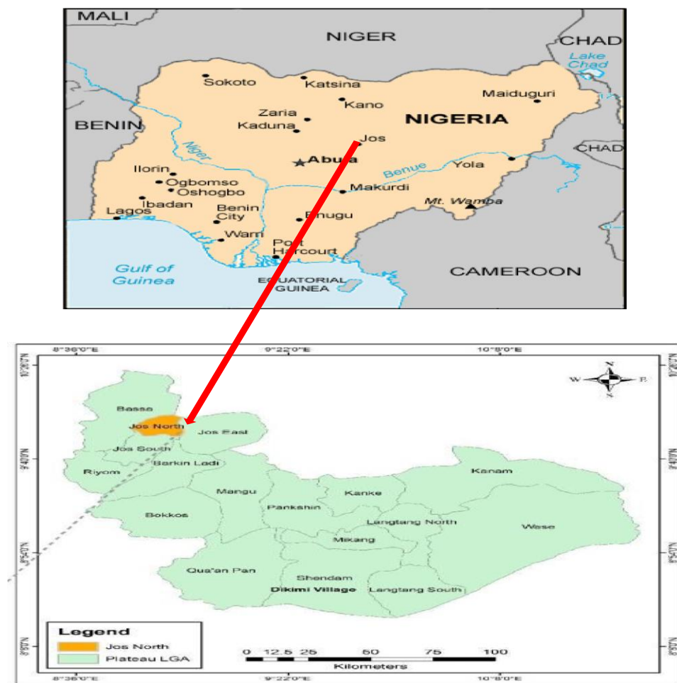
Figure 2: Map of Nigeria (top) showing Jos and Map of Plateau State (down) showing Study area.