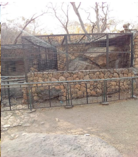
Plate xix: Construction and fencing of animal cages (Hyena house) at the Jos Zoo